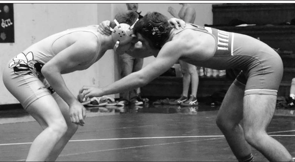
Towns County basketball